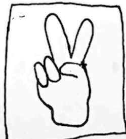
Yeah we can have fun sometimes