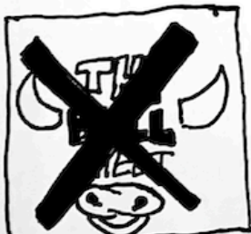
We've finally purged this university of satire