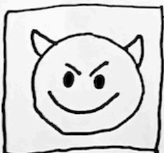
Debauchery on campus