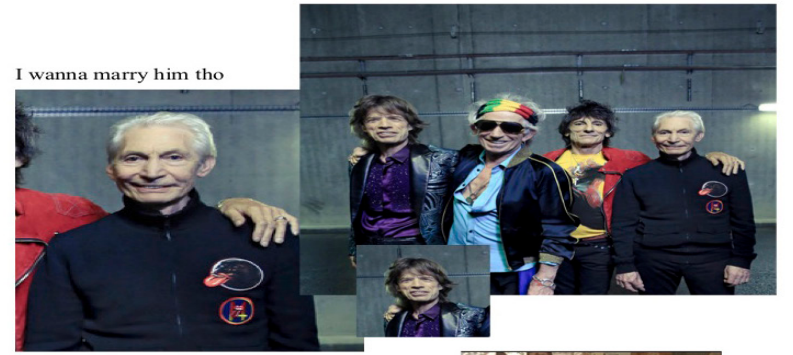
how am i supposed to know who's in radiohead??