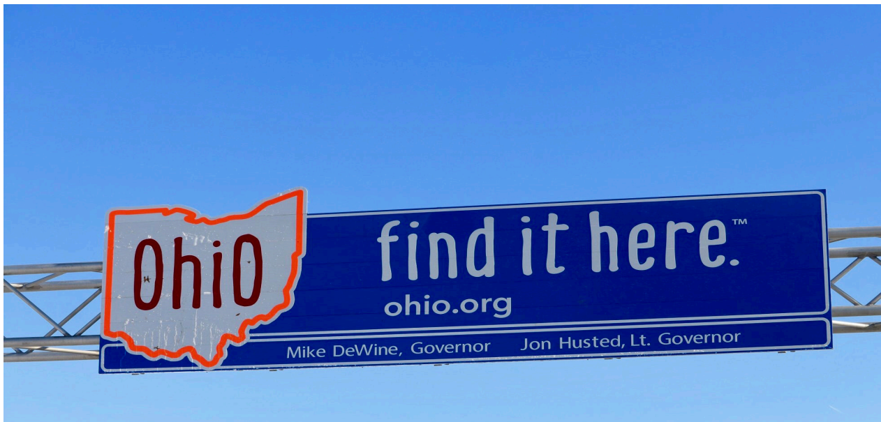
(Figure 1.1 - Why is it the Got Milk? font?)