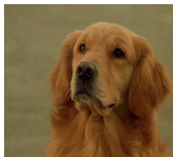
Player Spotlight: Buddy ‘28