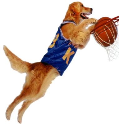
The controversial rookie, Air-Bud, delivers the game-winning shot

Unfortunately, not all the players warmed up to Buddy immediately.