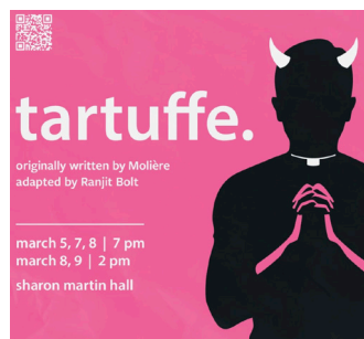
Huh?: Emmy Ayad ‘25